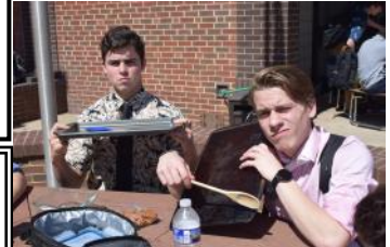
Senior ASSASSIN game.