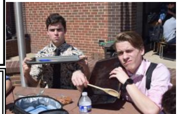
Senior ASSASSIN game.