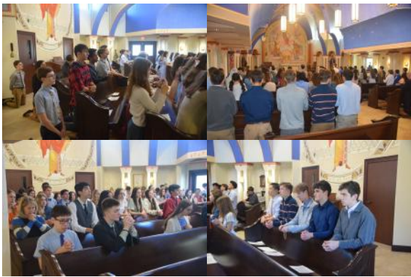
Seton Students Consecrating to Jesus through Mary on the March 25th, the Solemnity of the Annunciation.