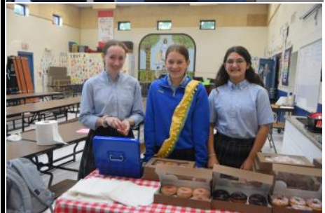
Donut Tuesdays are back!