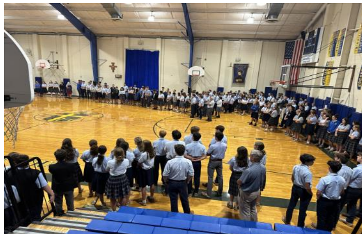
Students and Teachers praying the Rosary Sept 11 for our all those who died as a result of 9/11 and their families, for the welfare and future of the United States of America, for the election in particular that God's will be done, for conversion of hearts and minds.

Give grace to the citizens of this land so that they will choose leaders according to the Sacred Heart of Your Son, that His glory may be made manifest, lest we be given the leaders we deserve. Trusting in the providential care of God the Father and Your maternal care, we have perfect confidence that You will take care of us and will not leave us forsaken. O Mary Immaculate, pray for us. Amen