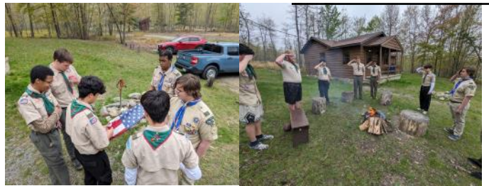
Seton Troop 554 respectfully burned the old U.S. Flag that was hanging outside our school.