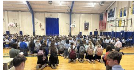
Seton students and faculty praying the St. Elizabeth Ann Seton Novena.

YEAR OF PRAYER: continued from Divine Intimacy. Although it is a simple matter, it is not always easy to pray and to pray well. It is an art to be learned. . . by diligently applying ourselves to prayer itself. While the essence of prayer is always the interior movement, the elevation of mind and heart to God, the forms of it differ; there is vocal prayer and mental prayer, discursive prayer [prayer that uses words—spoken, sung or thought] and affective prayer [simply lifting the heart to God through acts of love, adoration, etc.], private prayer and liturgical prayer [Mass, Sacraments, Liturgy of the Hours]. . . All these forms are good and serve to nourish our love for God, provided that we really put ourselves in touch with Him.