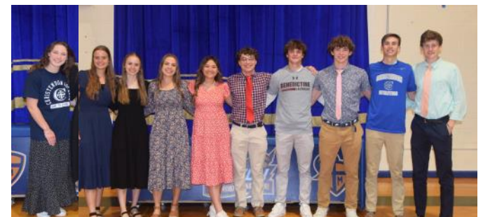
Class of 2024 Athletes playing sports at Belmont Abbey, Franciscan, Benedictine and Christendom Colleges!