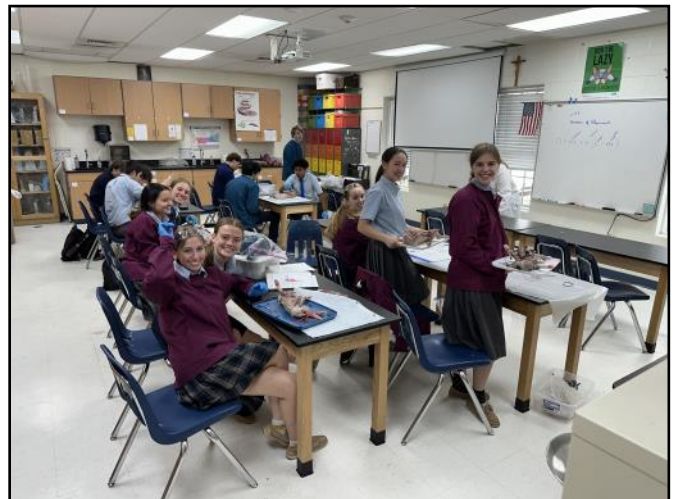
The Advanced Lab Science Class and their piglets!