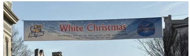
Check out our banner in Old Town Manassas!

Tickets may be bought in person from 8:30 AM to 2:30 PM in the Corpus Christi building on weekdays through March 26 (except not on March 14/15). Ticket Order Forms may be dropped off any day or mailed to 9314 Maple Street, Manassas, VA 20110 and will be left at the window to be picked up on the performance date.