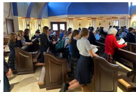
Students praying for the Total Consecration to Jesus through Mary.

These are timely words as we enter into the second half of Lent. "Mortification frees the soul from every obstacle which might retard the growth of grace, which might hinder the soul's love for God and its flight toward him; whereas prayer which consists essentially in intimate conversation with God feeds this love and quickens the flight. Mortification prepares a suitable place for a loving embrace with God; prayer effects this meeting, and by placing the soul in real contact with God, the source of living water, it quenches its thirst and reanimates it."