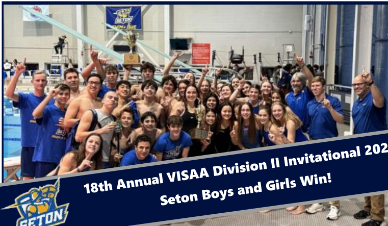
18th Annual VISA Division II Invitational 2024- Seton Boys and Girls Win!