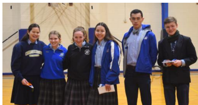
Seton High School Science Fair 1st Place Winners