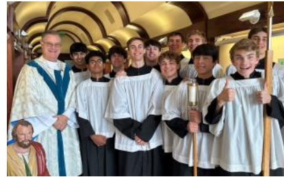
See more pics elsewhere in the Sentinel.