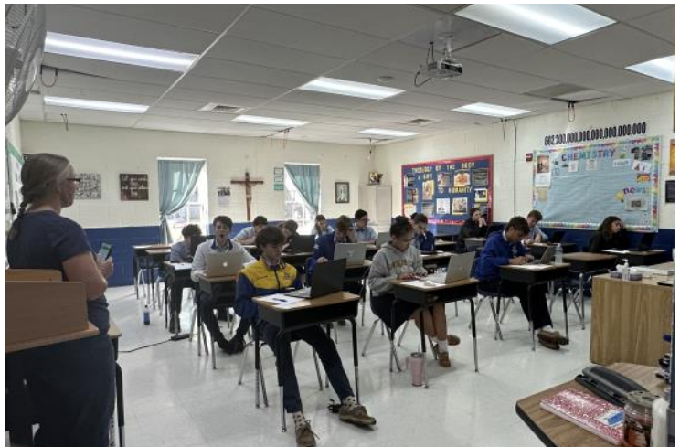
Juniors working hard on the PSAT which was done all online this year.

OUTERWEAR ORDER The October outerwear order is now open until Oct 16, you can order Seton-approved jackets online. Click here for more information. Order HERE with the password: seton23