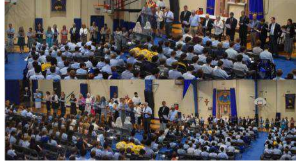
Faculty, staff, and Board of Directors proudly pledging our allegiance to Christ the King at the Opening Mass on Sept 1, 2023.

GRATITUDE II: Don't forget to order your tickets for the Night of Gratitude at the Hylton