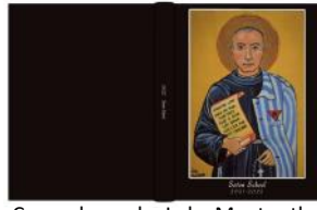
Cover drawn by Luke Mantooth.