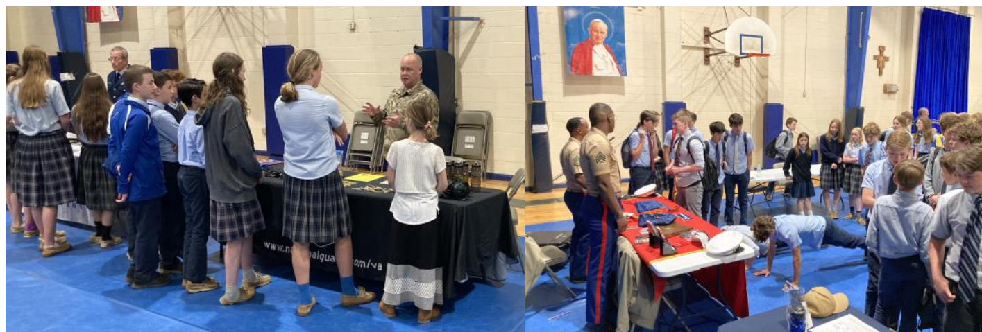
Military Day on May 13. Thank you to all our representatives: USCGA, USMMA, USNA, VMI, Air Force, Marine and Navy Recruiting, Army National Guard, and US Navy Sea Cadet!