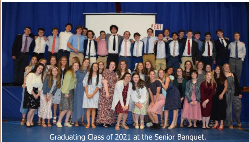
Graduating Class of 2021 at the Senior Banquet.