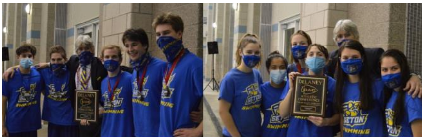
Congratulations to the Boys and Girls Seton Swim Team 2021 DAC Conference Champions