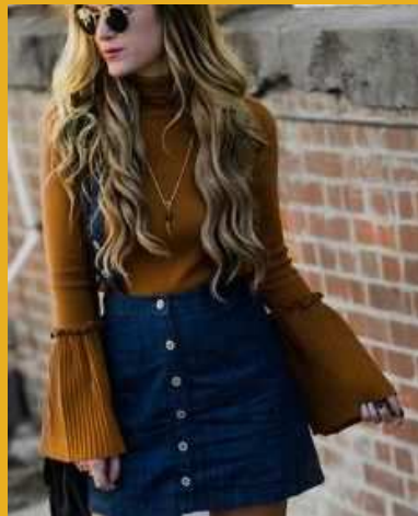
Bell sleeve sweater with jean skirt