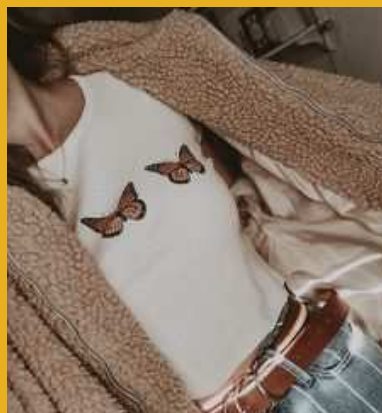
Graphic t-shirt with belt and Sherpa