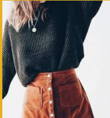
Oversized sweater with corduroy skirt

Abercrombie and Fitch: 11723 Fair Oaks Mall, Fairfax, VA 22033