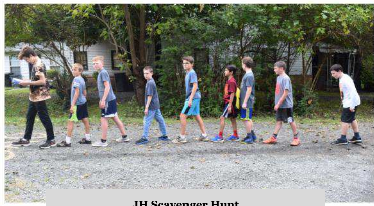
JH Scavenger Hunt