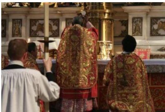
Cardinal Robert Sarah, prefect of the Congregation for Divine Worship, offers Mass in the London Oratory, July 6, 2016.

This is the title of a recently issued Vatican document written by Cardinal Sarah and approved by Pope Francis which is worth reading. It is also available on the Catholic Culture website. Click here .