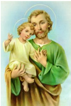
St Joseph pray for us

Students/Parents: Having technical issues with Online School? Email: studentsupport@setonschool.net