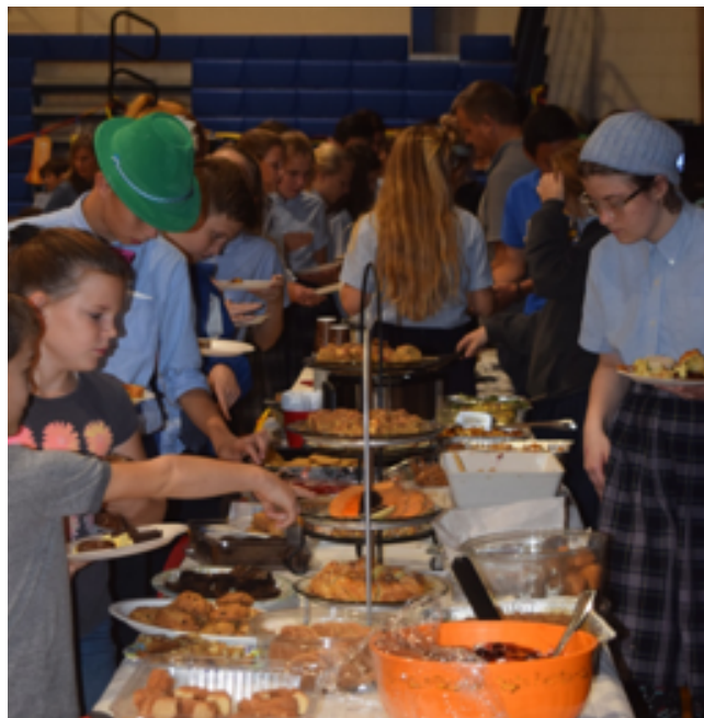
Some Seton students enjoying some delicious food provided by the German classes.