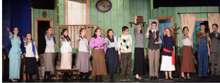
Click here for more pictures.