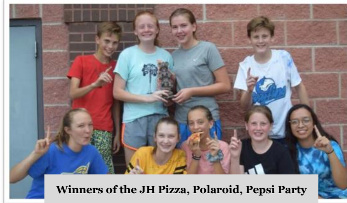
Winners of the JH Pizza, Polaroid, Pepsi Party

Seton School proudly announces the Spring Musical for 2020..... (click on the Seton Musical logo)