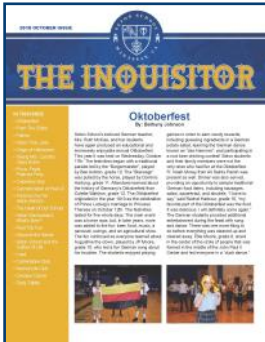
INQUISITOR OCTOBER ISSUE

Class of 2020 COLLEGE WORKSHOP All Juniors & Parent(s) are required to attend the College Workshop on Wed, Nov 7th from 7-8:30 PM in Faustina. This is a wonderful opportunity to find out about the college application process and financial aid!