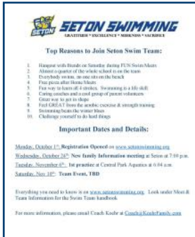
SETON SWIMMING FLYER