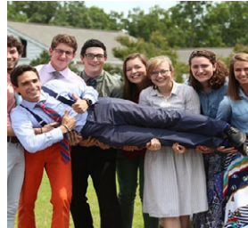
Above left: The camp counselors, all current Christendom students.