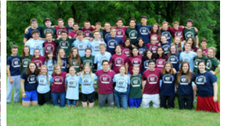
Above right: The participants of Session 2.

The participants also found out the numerous advantages of a Christendom liberal arts education. Christendom is well-known and renowned by prestigious colleges because it frequently sends its students to difficult schools, such as Harvard and Oxford. Christendom teaches its students how to think, rather than giving them specialized job training like many modern colleges, which is why Christendom students are so successful. Christendom students have ventured into almost every field imaginable, from business to entertainment to even astrophysics!