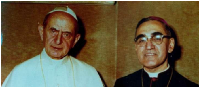
Pope Paul VI with Archbishop Romero

Sources: https://libcom.org/history/1970-1990-the-war-of-counter-insurgency-in-el-salvador