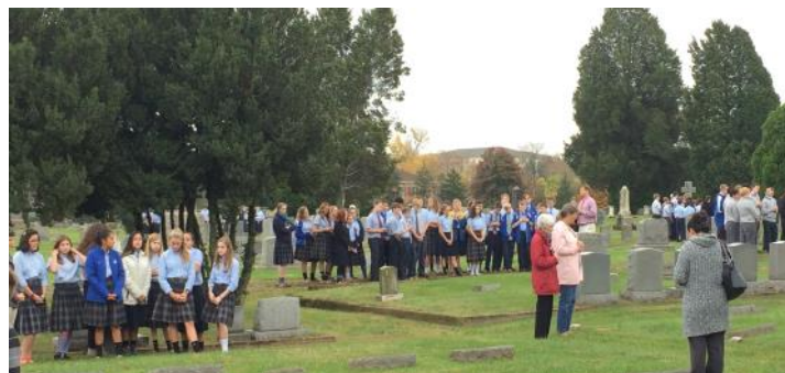
All Souls Day Octave walking pilgrimage to the cemetery .

Reminder: Seton dances (except for the Prom) are closed dances. Only currently enrolled Seton High School students may attend.